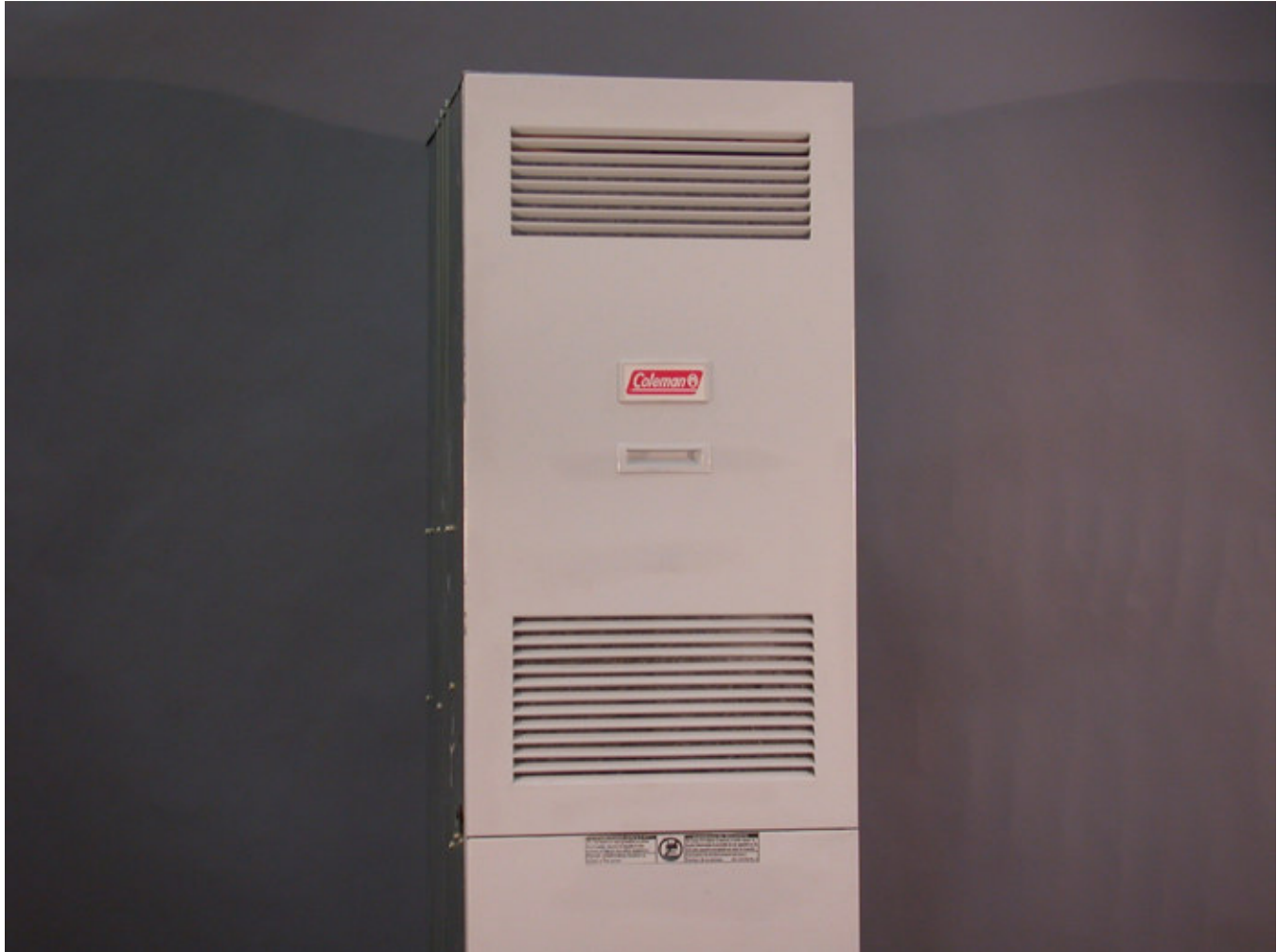
Furnace Front Access

Note: Health Canada's press release is available at http://cpsr-rspc.hc-sc.gc.ca/PR-RP/recall-retrait-eng.jsp?re_id=1416