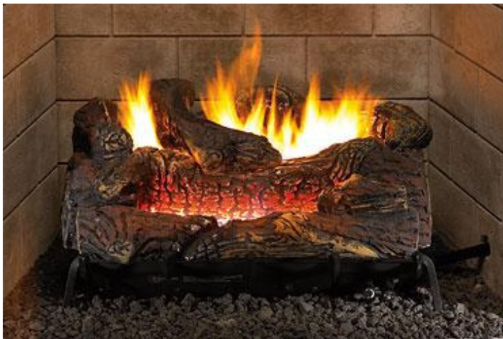
VFGL Log Set

Consumer Contact: For additional information, please contact Lennox Hearth Products at (800) 826-8546 between 8 a.m. and 4 p.m. CT Monday through Friday, or visit the firm’s Web site at http://www.lennoxhearthproducts.com