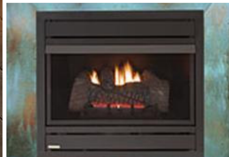
VF4000, VF5000 & VF6000 Fireplaces