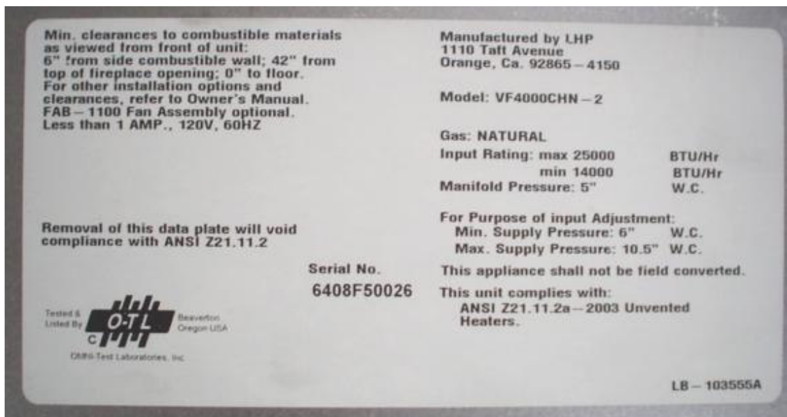
Sample Fireplace Rating Plate