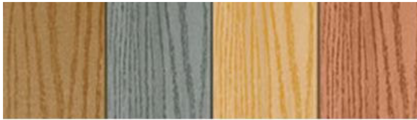
Tuscan Walnut/ Chestnut Driftwood Grey/ Greystone Pacific Cedar Western Redwood