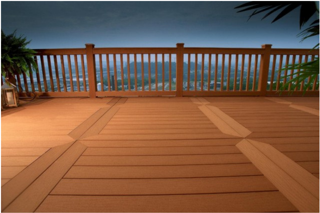
Photo of installed decking